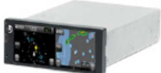
Under 2-kg Class 3 UAV & UAM