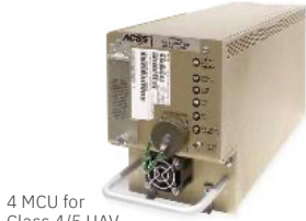
4 MCU for Class 4/5 UAV

L3Harris continues to enhance aircraft surveillance capability by actively collaborating with industry and agency forums working together for consensus among safe UAS/UAM entry into commercial and private airspace. The new L3Harris ACAS X products and sensor development are designed for UAS/UAM and aligned to industry Minimum Operational Performance Standards. These solutions provide OEMs progressive DAA technology to meet various platforms and critical aviation modernization demands for military missions as well as commercial urban mobility. To learn more, email UASdevelopmentinquiry@L3Harris.com .