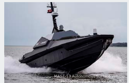
MAST-13 Autonomous Surface Vehicle Produced by L3Harris for Dstl (UK)