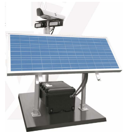
Above: Vantage camera pod