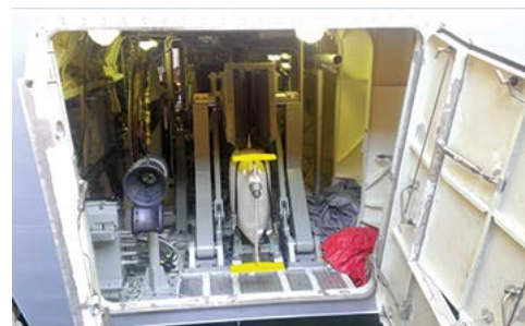
Platform-Scalable ASW Solution