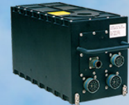
Digital Map Computer (DMC) Digital Video Map Computer (DVMC)