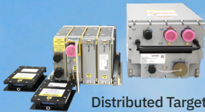
Distributed Targeting Processor (DTP) Mass Storage Unit (MSU)