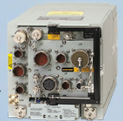
Multifunction Information Distribution System (MIDS) Low Volume Terminal (LVT) 1