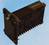
Digital Memory Device (DMD)