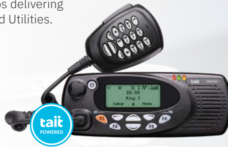
TM9400 DASH MOUNT WITH KEYPAD AND MICROPHONE

L3Harris longevity and expertise in tactical communications technology is unmatched. We leverage this, along with First Responder insights, to engineer mobile radios delivering rugged, reliable performance for Public Safety and Utilities.