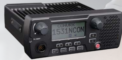
XG-25M FRONT MOUNT WITH CH-25 CONTROL HEAD UNIT