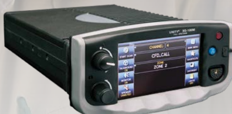
XG-100M FRONT MOUNT WITH CH-100 TOUCHSCREEN CONTROL UNIT