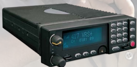
XG-75M FRONT MOUNT WITH CH-721 FULL KEYPAD CONTROL UNIT