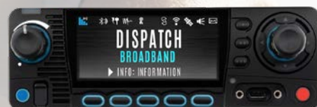
XL-185M AND XL-200M FRONT MOUNT WITH MICROPHONE