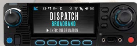
XL-185M AND XL-200M FRONT MOUNT WITH MICROPHONE