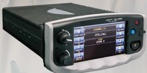
XG-100M FRONT MOUNT WITH CH-100 TOUCHSCREEN CONTROL UNIT