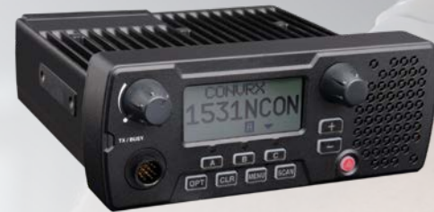
XG-25M FRONT MOUNT WITH CH-25 CONTROL HEAD UNIT