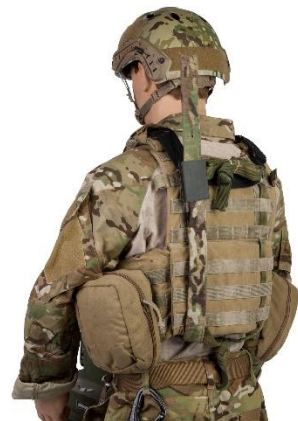
Figure 2. Photos show Dual-band Antenna with the L-band section over shoulder (conformal) and vertical (performance deployment).