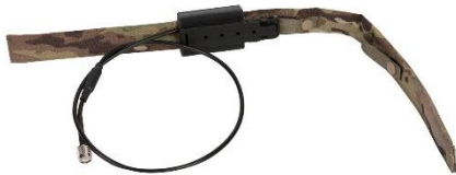
Figure 1. The L3Harris Dual-band (UHF and L-band) Antenna is housed in cotton-like webbing that simplifies integration into the warfighter’s kit.

The new L3Harris antenna is designed from the ground up to be a partner to the STC radio, providing consistency of performance over a wide range of frequencies. Its capabilities represent the largest spectrum of any covert antenna option available today, and the only UHF and L-band transmission in a single antenna. The antenna also has a unique, internal coupling innovation allowing the antenna to switch between transmission modes as needed.