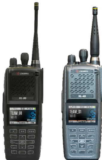
XL-95P and XL-45P XL Connect Series Portable Radios