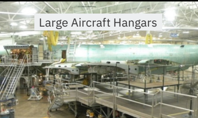
Large Aircraft Hangars