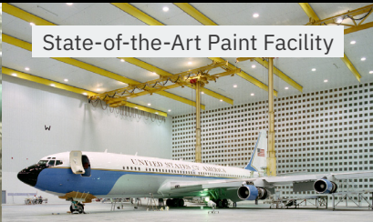
State-of-the-Art Paint Facility