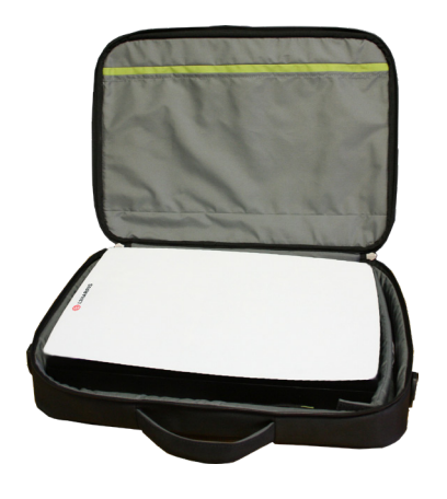
Designed to fit in a laptop-sized travel bag

To learn more about Shadow Flat Panel VSAT, visit https://www.l3harris.com/all-capabilities/shadow