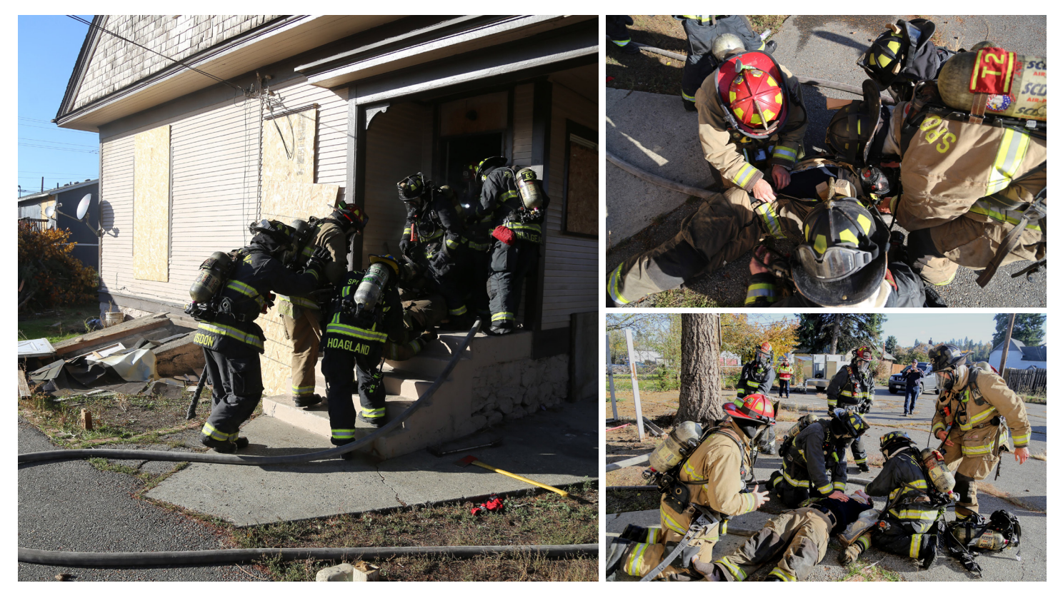
Once firefighters have trained and practiced on mayday basics, you can integrate these skills into a larger scenario to better simulate how it would develop on an actual incident. A more advanced drill might involve an acquired structure – a single-family house – where crewmembers must remove a downed firefighter from the structure and begin treatment.

move them to a new area, then ask the firefighter to find the exit or another landmark. If firefighters can't answer correctly, they need to call a mayday.