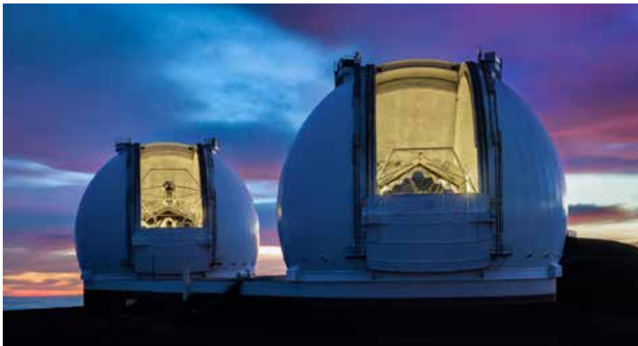
L3Harris provides precision optics for the most advanced ground telescopes, like the Keck 1 and Keck 2 at the W.M. Keck Observatory in Hawaii