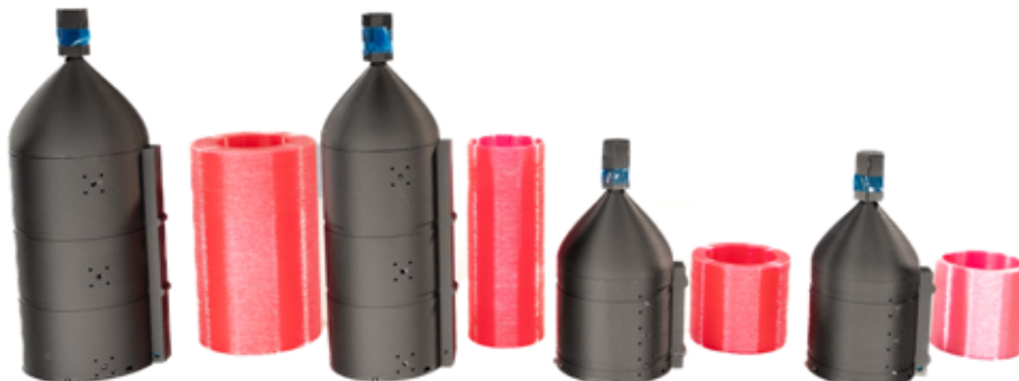
FIBER PACK LENGTH FROM LEFT TO RIGHT: 20 KM, 12 KM, 5 KM, 2 KM