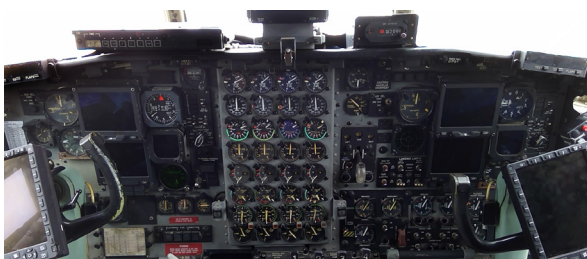
Instrument Panel before AMP Increment 2 Upgrade